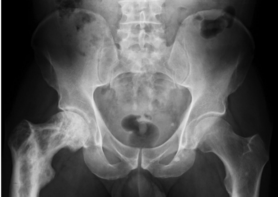
Fig. 1. X-ray features of PDB. Pelvic radiograph from a patient with PDB affecting the upper right femur showing alternating areas of osteolysis and osteosclerosis in the greater and lesser trochanters and femoral neck; loss of distinction between the cortex and medulla in the upper femur; bone expansion and deformity of the affected femur; and a pseudofracture on the lateral aspect of the femur opposite the lesser trochanter.